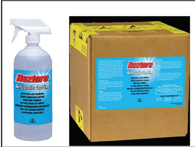
Figure 1. Reztore® Antistatic Coating 1 Quart (1 liter) Spray Bottle 2.5 Gallons (10 liters) Bag-in-Box