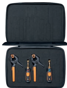
AC & Refrigeration Kit: 0563 0002 20