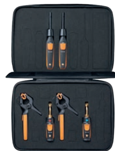
AC/R Test & Load Kit: 0563 0009