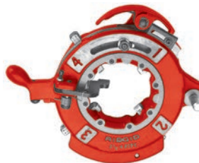
No. 714 & No. 914