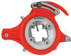
No. 711 & No. 914