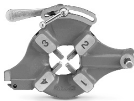
No. 713 & No. 913