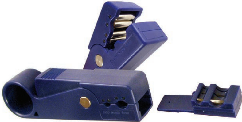
Pre-Set Blade Cartridge