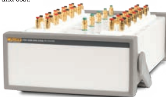
1586-2588 DAQ-STAQ Multiplexer

Universal input channels accepts 2-, 3-, or 4-wire connections to measure temperature, resistance, dc voltage, and dc current for data acquisition applications on the factory floor where channel count and scan speed are important.