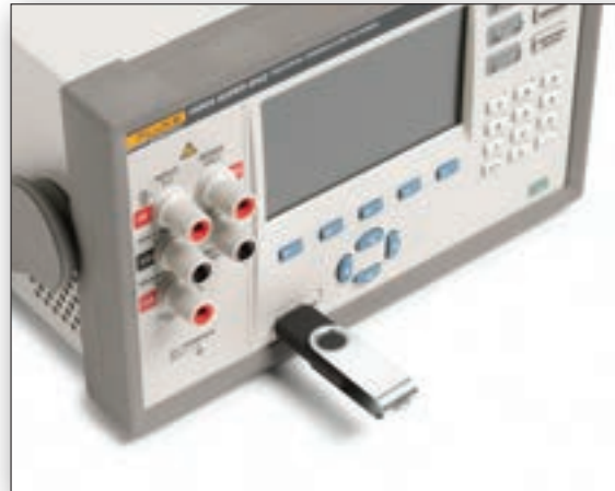
Easily transfer Super-DAQ data and setup files using a USB flash drive.

The Super-DAQ also includes two levels of data security to prevent unauthorized users from tampering with or forging test data or setup files. This security feature is especially important to industries that are regulated by government agencies where data traceability is required.