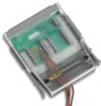
1586-2586 High-Capacity Module

For a calibration lab where accuracy is of primary importance, the Super-DAQ is best configured with a DAQ-STAQ Multiplexer. The external DAQ-STAQ features mini-jack thermocouple terminals—each with its own reference junction sensor—and patented mini-DWF, gold-plated input terminals, which accept bare wire, spade lug, or mini-banana-plug probe terminations. Easily connect and disconnect PRTs, thermistors, and thermocouples for benchtop temperature calibration. It can be stacked on the 1586A to reduce footprint in busy labs. Having the flexibility to configure the Super-DAQ for factory or lab use reduces your equipment needs and cost.