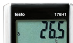
Large, clear display for showing measurement values