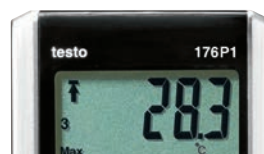
Large, clear display for showing measurement values