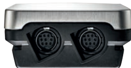
Probe connection at lower end of housing for two temperature/humidity probes