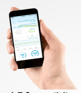
IoT Connectivity Protect your work

Point device to your account to begin controlling device