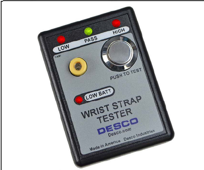
Figure 1. Desco 19240 Portable Wrist Strap Tester