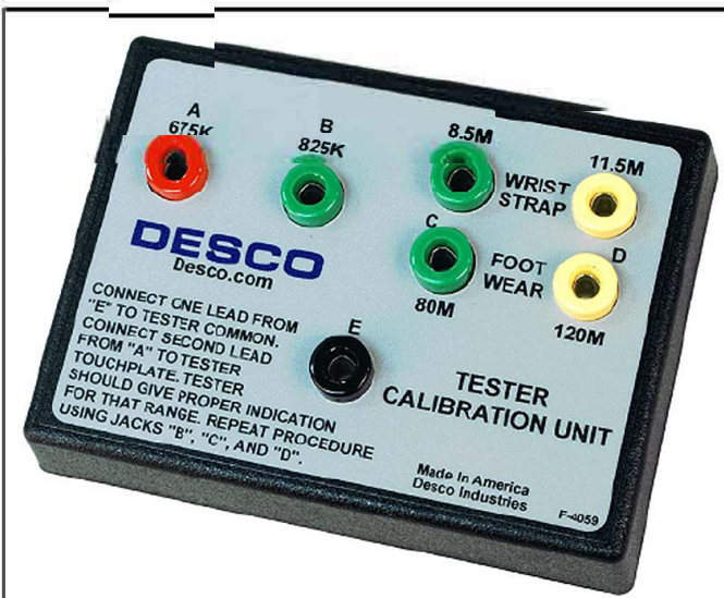
Figure 3. Desco 07010 Calibration Unit

View technical bulletin TB-2039 for more information on the Desco 07010 Calibration Unit and instructions to calibrate the Wrist Strap Tester.