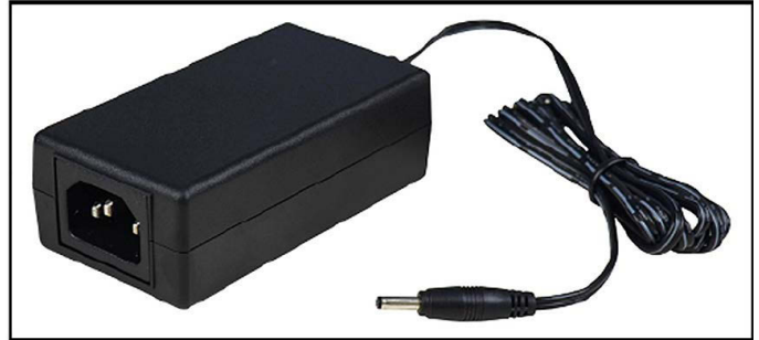
Figure 3. Universal power adapter included with the 19243 Mini Monitor

NOTE: The power cord must be purchased separately if ordering the 19243 Mini Monitor. The power cords are available as the following item numbers: