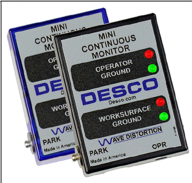
Figure 1. Desco Mini Monitor