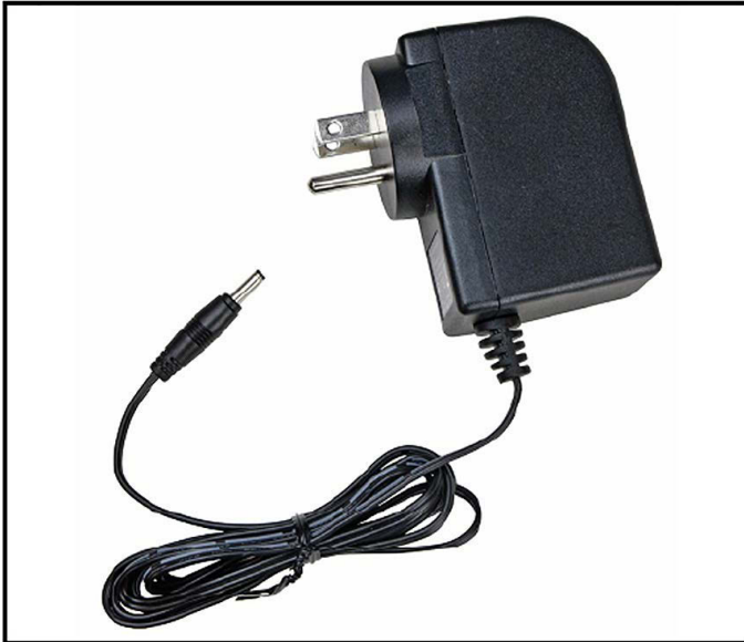
Figure 2. North American power adapter included with the 19239 and 19242 Mini Monitors