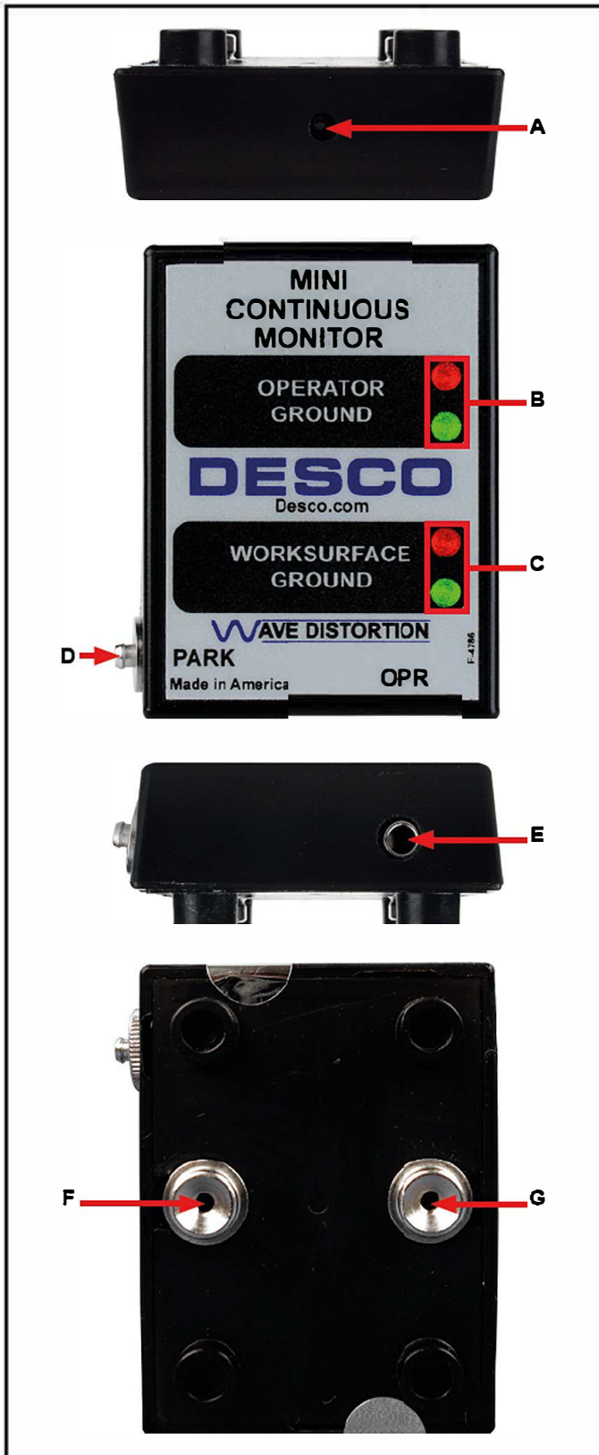
Figure 4. Mini Monitor features and components

A. Power Jack: Connect the included 24VDC power adapter here.