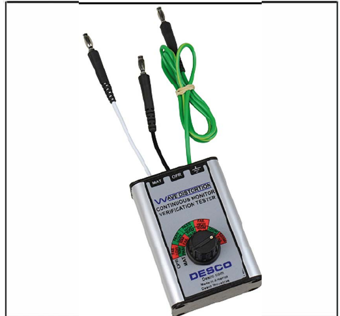
Figure 9. Desco 98221 Wave Distortion Monitor Verification Tester