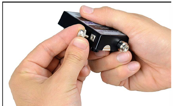
Figure 7. Changing the park snap on the 19243 Mini Monitor

The 19243 Mini Monitor includes an interchangeable 10mm park snap and 10mm banana jack adapter for operators who use wrist cords with 10mm terminations. Use the park snaps' knurled rims to unscrew the 4mm park snap from the monitor and install the 10mm park snap to the monitor. Plug the 10mm operator jack adapter into the monitor's operator jack.