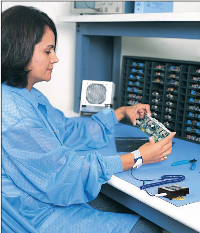
Figure 8. Using the Mini Monitor