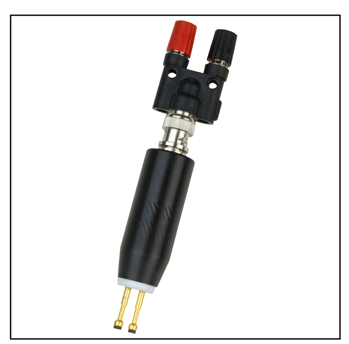
Figure 1. Desco 19297 Two-Point Resistance Probe