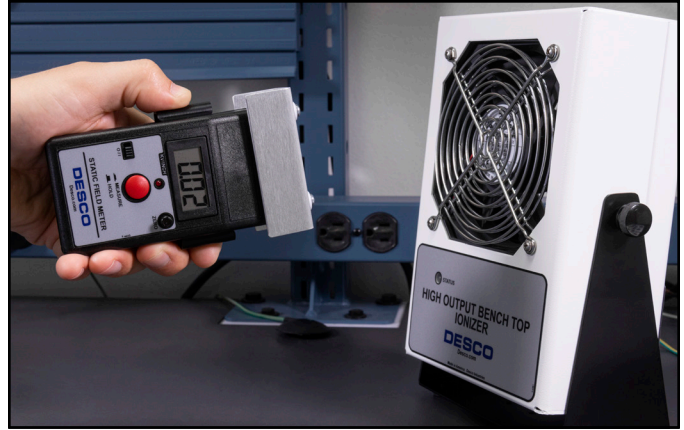
Figure 9. Using the Digital Static Field Meter with Conductive Plate to measure the offset voltage of a benchtop ionizer

NOTE: When testing pulsed ionizer systems, the voltage displayed is constantly changing. This pulse rate may be faster than the display update rate of the Digital Static Field Meter, therefore the displayed voltage is an average of the actual voltage. The output of the Digital Static Field Meter is useful in this situation for more accurate measurements.