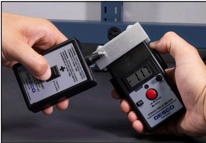
Figure 10. Using the Charger to apply a charge onto the Conductive Plate

NOTE: A ground path must be provided between the touch plate of the Charger and the ground reference of the Digital Static Field Meter. This is normally provided by holding the Charger in one hand and the Digital Static Field Meter with Conductive Plate in the other.