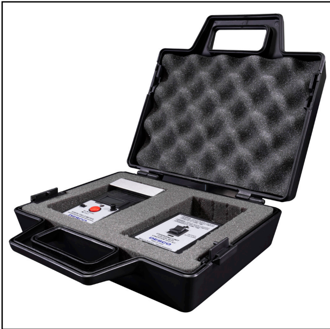
Figure 3. Air Ionization Test Kit and Carrying Case