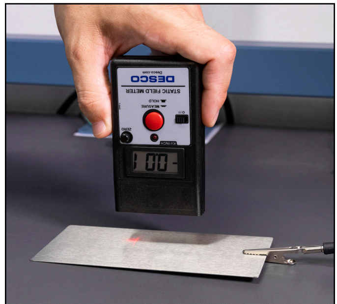
Figure 6. Pointing the Digital Static Field Meter to a grounded surface

Slide the power switch to the right to power the Digital Static Field Meter. Point the top of the Digital Static Field Meter approximately 1 inch (2.5 cm) away from a grounded metal surface. Proper spacing is indicated when the two red bullseyes emitted LED range indicator become centered on top of each other. Turn the rotary zero knob until the Digital Static Field Meter's display reads 0.00.