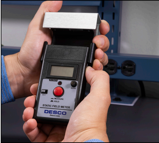
Figure 8. Sliding the Conductive Plate onto the Digital Static Field Meter