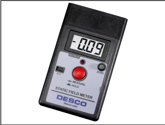
Figure 1. Desco 19442 Digital Static Field Meter