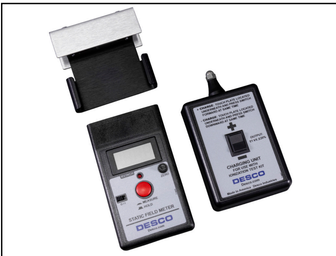
Figure 2. Desco 19443 Air Ionization Test Kit