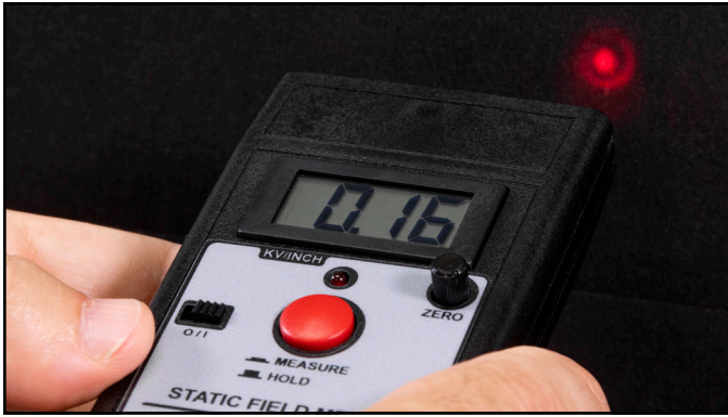
Figure 7. Aligning the two bullseyes emitted by the LED range indicator