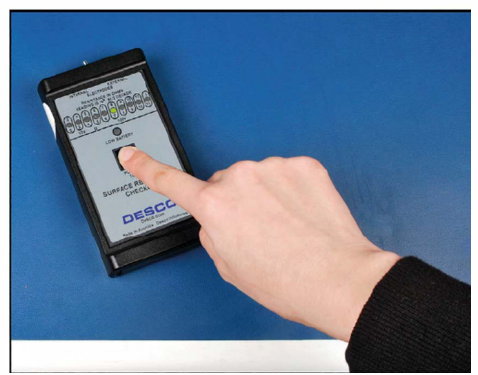
Figure 3. Using the parallel electrodes to measure surface resistance

If the measurement is outside acceptable limits, clean the surface with an ESD cleaner containing no insulative silicone such as Desco <u>10435</u> Reztore® Surface & Mat Cleaner, and re-test to determine if the cause of failure is an insulative dirt layer or the ESD worksurface material.