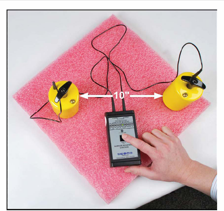
Figure 4. Using the <u>19641</u> test leads and <u>50003</u> fivepound electrodes to measure Rtt

Clean the material's surface for test lab measurements, but do not clean the surface for materials that are already installed. Only clean and re-test the installed material if failure occurs.