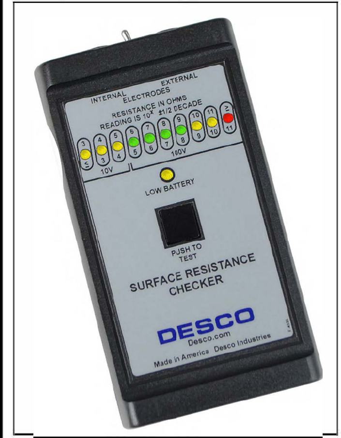
Figure 1. Desco <u>19640</u> Surface Resistance Checker