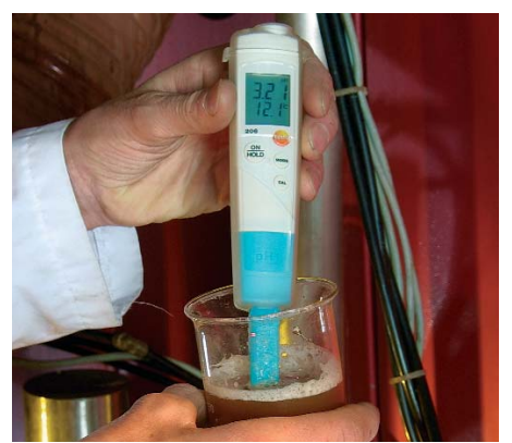
testo 206-pH1 is ideal for measurements in liquids