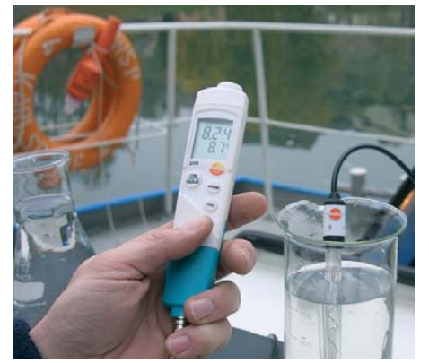
Automatic temperature compensation in external probes with temperature sensor