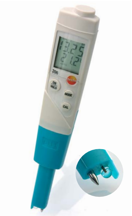
pH1 probe head for liquids