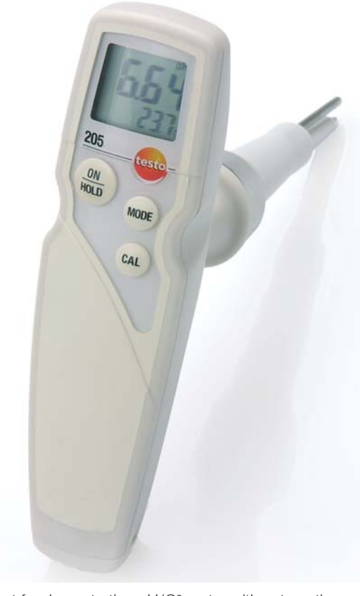
Robust food penetration pH/C° meter with automatic temperature compensation