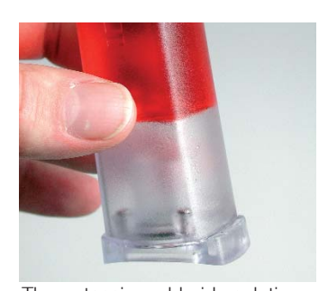
The potassium chloride solution bonded in the gel cannot leak.