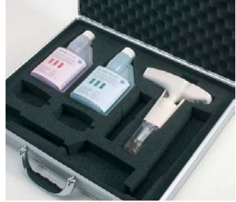
Set case with testo 205, pH 4.0 and 7.0 buffers as well as storage cap