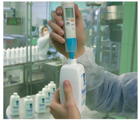
Automatic full scale value recognition and clear 2 line display.