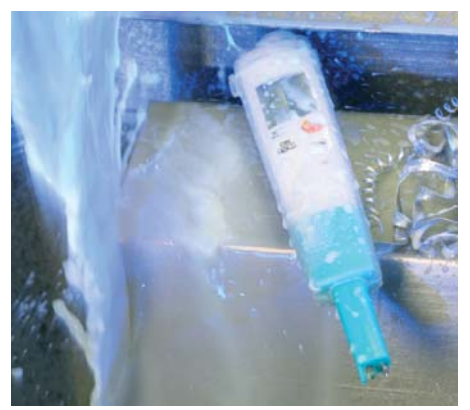
The "TopSafe" case protects in tough industrial conditions