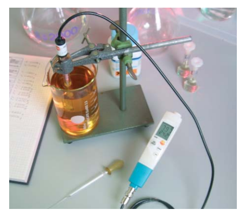
testo 206-pH3 faciltates the connection of external pH probes