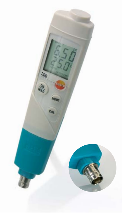
pH3 probe head with BNC interface