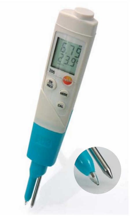
pH2 probe head for semisolid materials