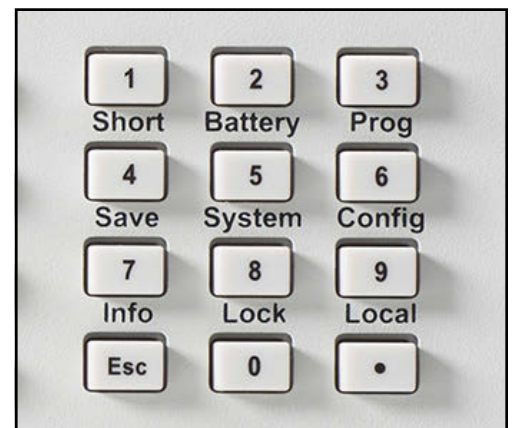
Figure 1. Use either the rotary knob or the keypad to quickly enter settings and set parameter values using all the available resolution.