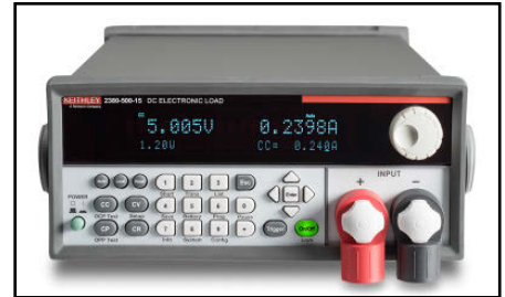
Model 2380-500-15 front view showing the safety covers on the input terminals.