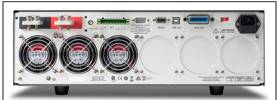
Model 2380-500-30 rear panel