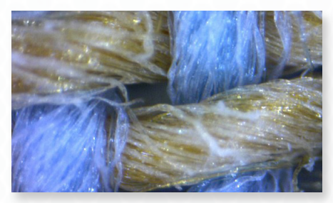
Excellent Color Reproduction