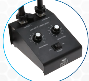
Light Adjustment Knobs for Each Illuminator and On/Off Switch on Metal Base