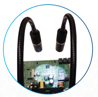
Illuminate and Overlap Spotlights at Any Angle