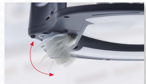
Tilt the Camera to Adjust the Image On Screen to Your Desired Angle