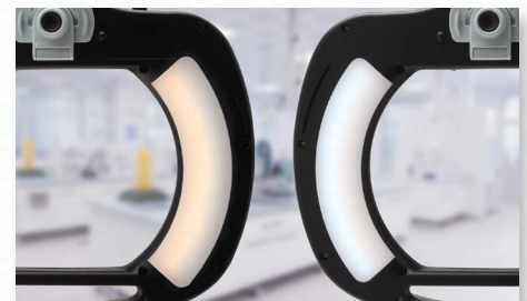
Frosted Diffuser w/ Color Temperature Controls