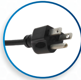
6 ft Power Cord w/ 100V Plug