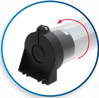
120 ° Adjustable Illumination