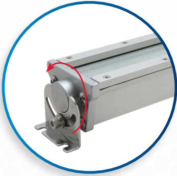
120 ° Adjustable Illumination