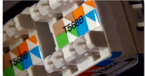
360 Viewer (View Objects at a 35 Degree Angle)