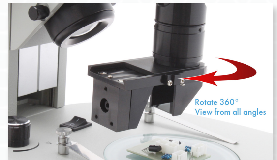
Inspect Parts from Any Angle