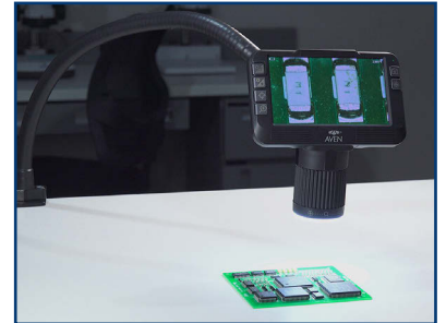
EzImage X3 Download Included