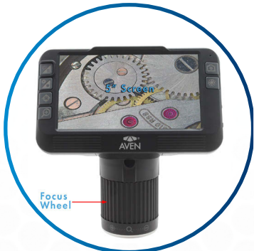
Crystal Clear 5" Screen