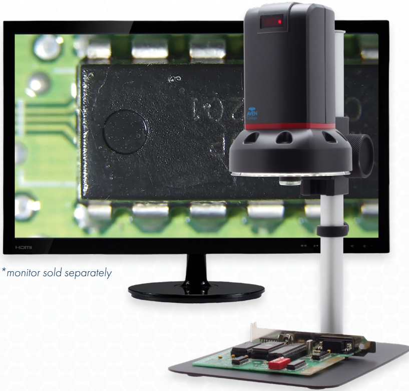
*monitor sold separately