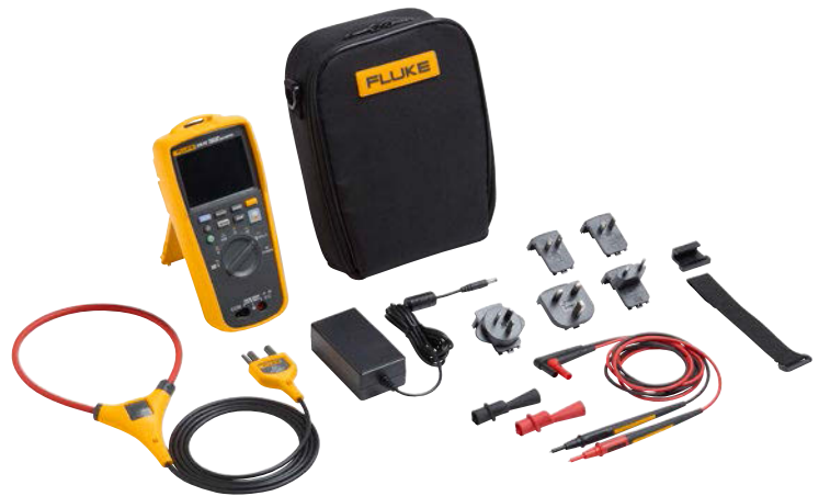
Figure 2. Fluke 279 FC/iFlex TRMS Thermal Multimeter Kit