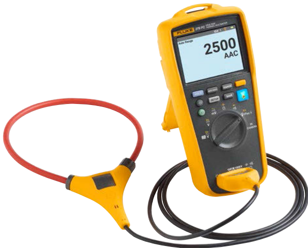
Figure 1. Fluke 279 FC with the iFlex Flexible Current Probe