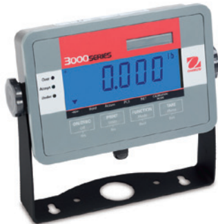
T32MC (LCD version)