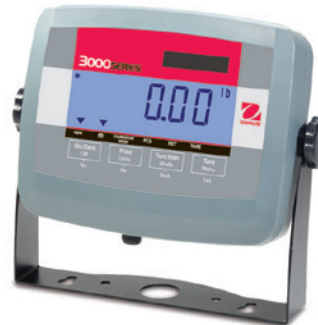
T31P Indicator shown with optional bracket