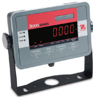
T32ME (LED version)