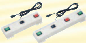
9613 REMOTE CONTROL BOX (SINGLE) (option)

Flashes a warning during testing and whenever high voltage is present at the terminals. The DANGER lamp turns off when the voltage at the output terminals is no greater than AC 30 V or DC 60 V.