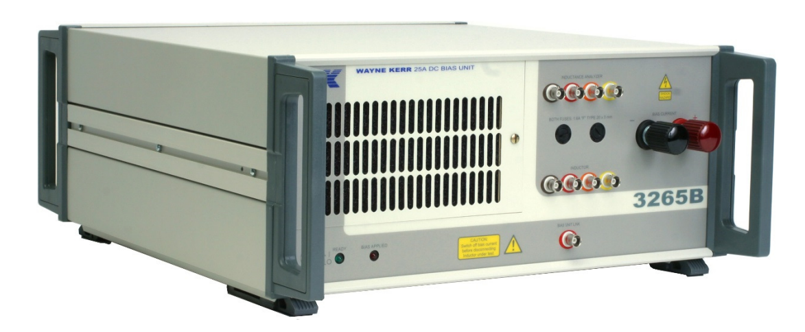
3265B DC Bias Unit can deliver up to 25 A of DC bias current in steps of 0.025 A

The 3265B has a number of safety and protection features including a safety interlock system to protect users against back EMFs. It is also fully protected against overtemperature, excess voltage drop and sense lead failure.