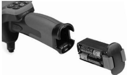
Figure 4 – Battery Compartment