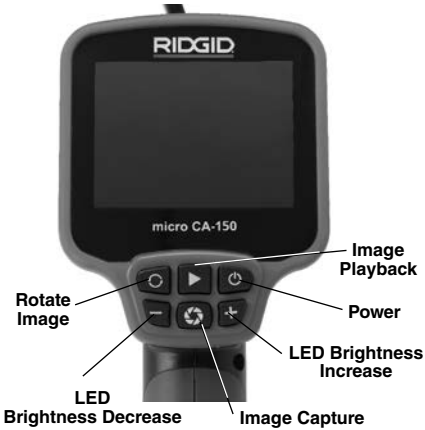
Figure 8 – Controls