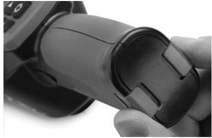
Figure 3 – Battery Compartment Cover

(See Figure 4). If needed, remove batteries.