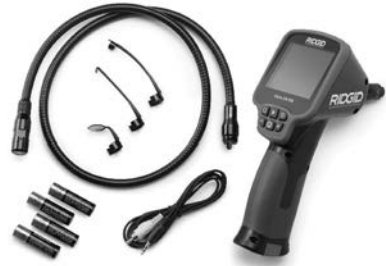
Figure 1 – micro CA-150