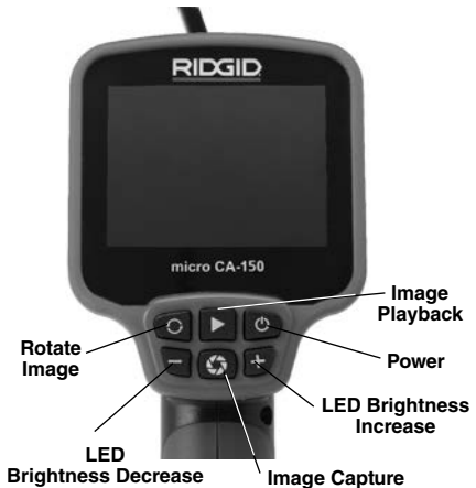
Figure 2 – Controls