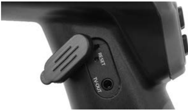
Figure 9 – TV-OUT Jack/Reset Button