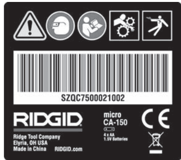
Figure 7 – Warning Label