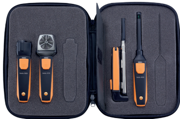
VAC Smart Probe Kit: 0563 0003