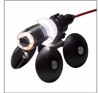
Camera holding fixture on top securing the Wohler VIS Camera Head, dia 2" and supplementary lighting as well as a stabilization sleeve.