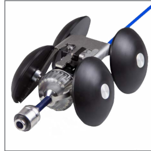
Wohler VIS Camera Head, dia 1" with supplementary lighting attached below the trolley.