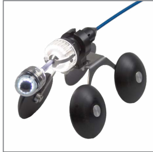
Wohler VIS Camera Head dia 1.5" with supplementary lighting and stabilization sleeve.