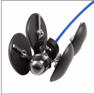
The camera trolley remains in operation even when in a tilted position.