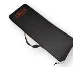
Soft Carrying Case Included with Every Unit