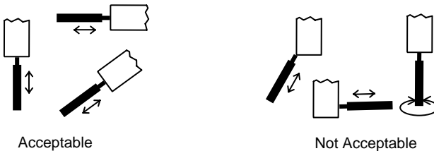
Figure 1 – Correct and Incorrect Angles of Measurement

Note: The sensing head with adapter must be in line with the object being measured. Avoid rotating the sensing head. Refer to the figure below.