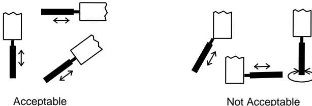
Figure 1 – Correct and Incorrect Angles of Measurement

Note: The sensing head with adapter must be in line with the object being measured. Avoid rotating the sensing head. Refer to the figure below.