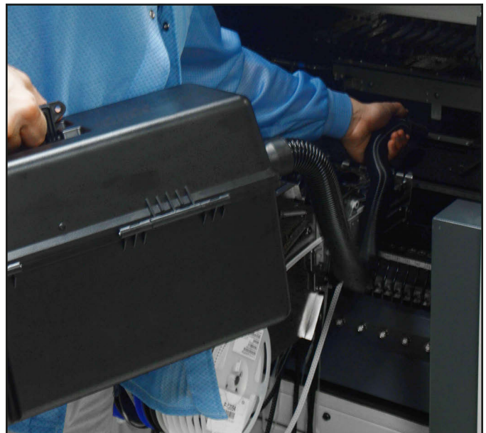
Figure 3. Using the 497 Electronic Service Vacuum

Use the power switch to power the vacuum ON. Use the carrying handle or SV-CS1 carrying strap to carry and transport the vacuum.