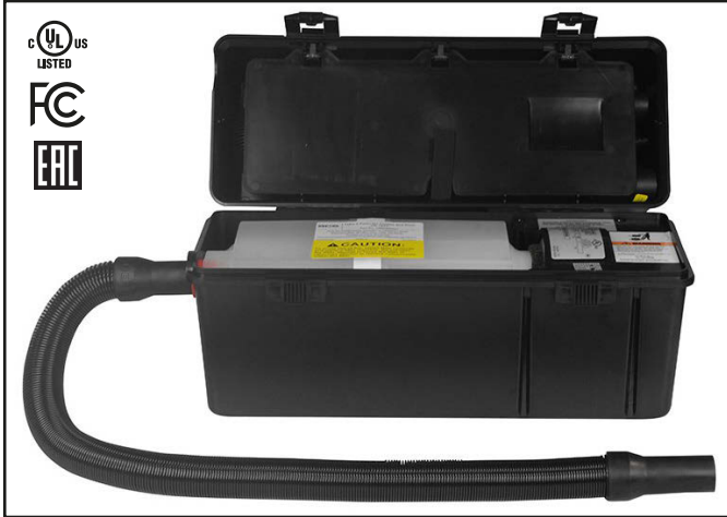
Figure 1. SCS 497 Electronic Service Vacuum