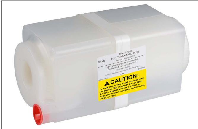
Figure 4. SCS SV-MPF2 Type 2 Replacement Filter