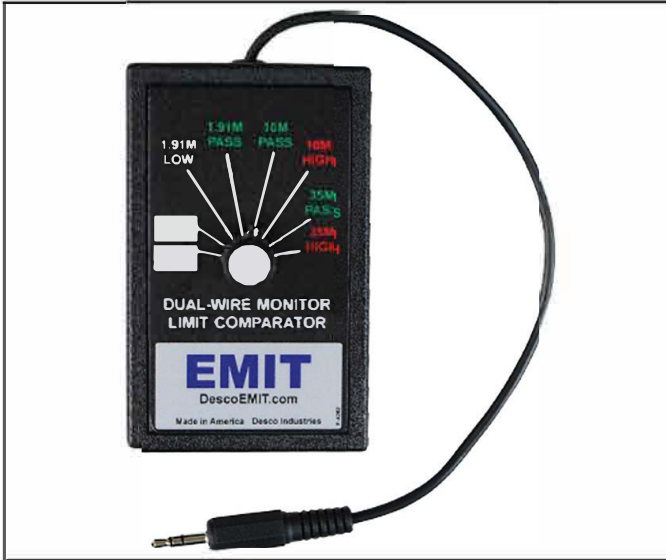
Figure 1. EMIT 50524 Limit Comparator