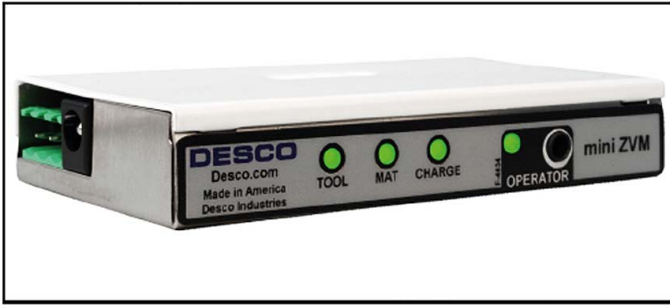
Figure 6. Desco Mini Zero Volt Monitor