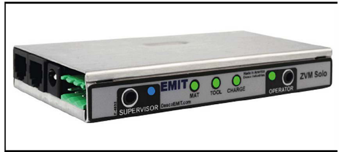
Figure 3. EMIT Zero Volt Monitor Solo