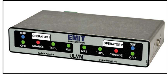
Figure 5. EMIT Ultra Low Voltage Monitor