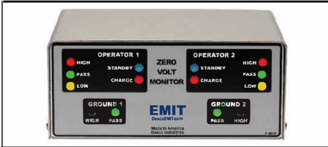
Figure 2. EMIT Zero Volt Monitor