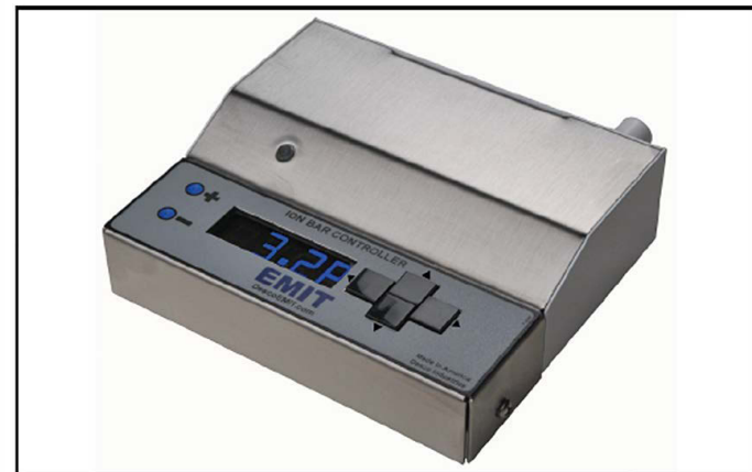
Figure 6. EMIT 50855 Controller with Digital Adjustment