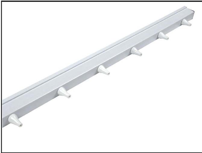
Figure 1. EMIT Non-Air Assisted Ion Bar