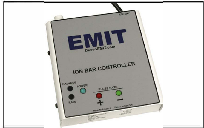
Figure 4. EMIT 50940 Controller with Recessed Potentiometer Adjustment