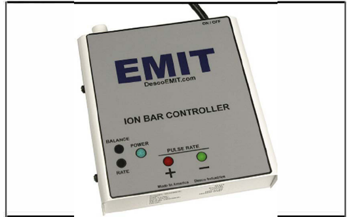
Figure 4. EMIT 50940 Controller with Recessed Potentiometer Adjustment