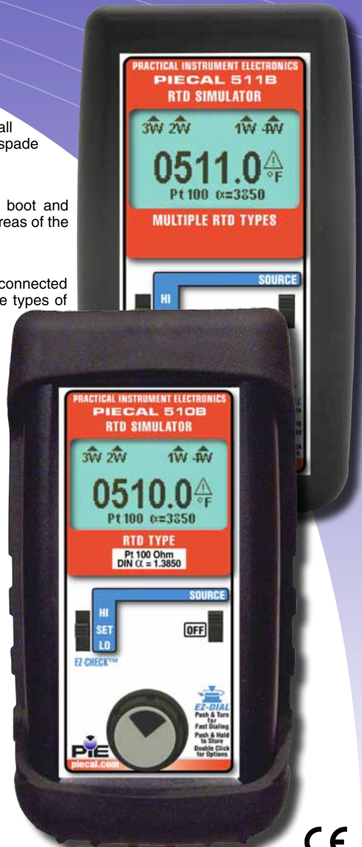
Actual Size (Shown with optional boot)