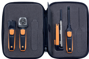
VAC Smart Probe Kit: 0563 0003