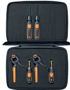
AC/R Test & Load Kit: 0563 0009