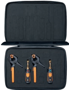
AC & Refrigeration Kit: 0563 0002 20