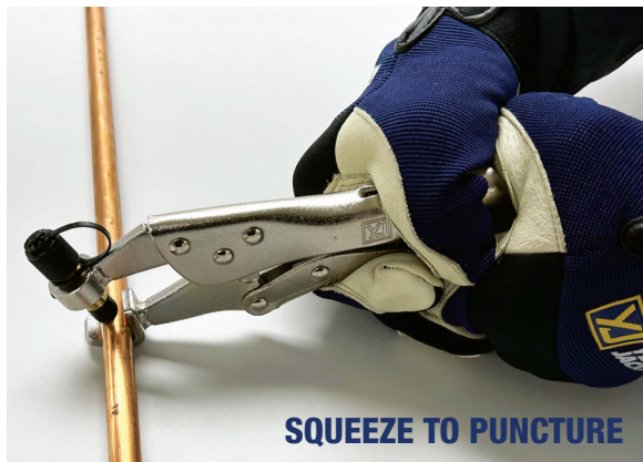
SQUEEZE TO PUNCTURE