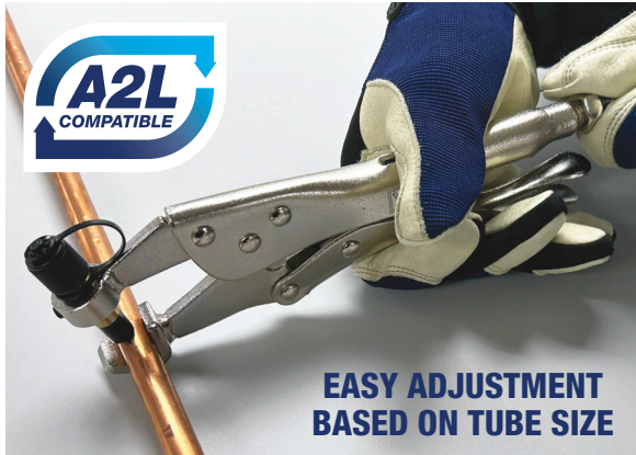
EASY ADJUSTMENT BASED ON TUBE SIZE