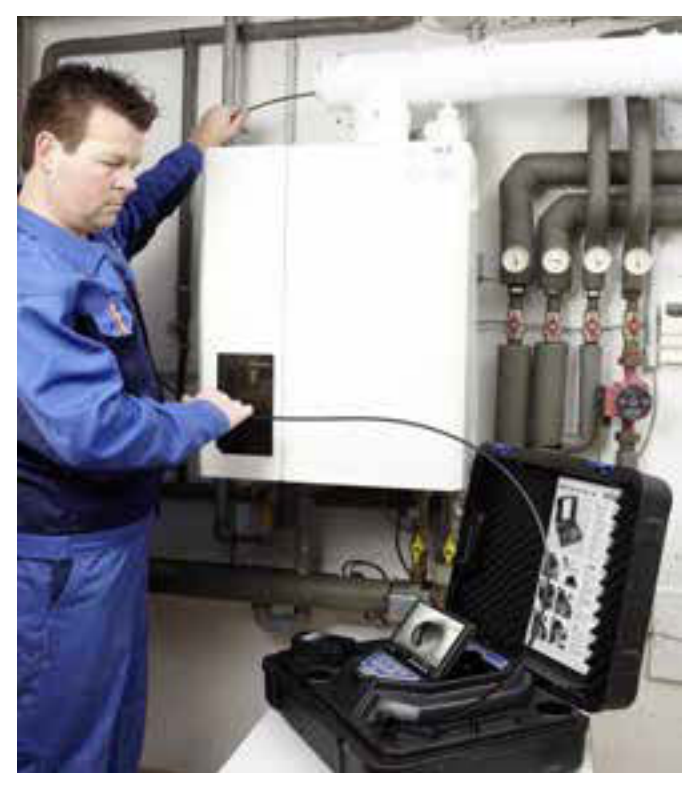
The service camera is an essential partner in a wide range of applications including the analysis of flue gas installations.