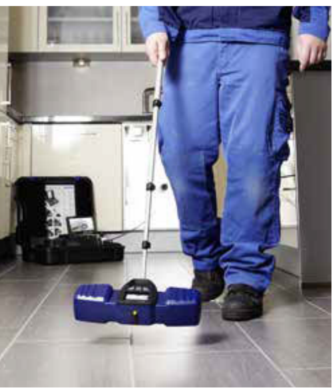
The actual meter count and the position of the head are displayed in the monitor. The Wohler L 200 Locator makes it possible to locate the camera.