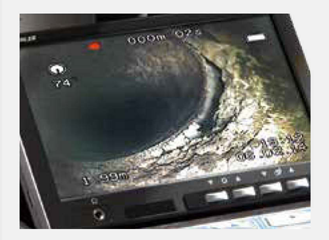
The "Save function" makes it possible to save and view what you see at the push of a button. The integrated position indicator ensures you keep your sense of orientation in the pipe.