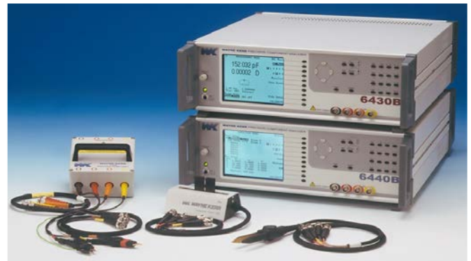
Accurate component analysis to 500 kHz (6430B) or 3 MHz (6440B) is simplified by many accessories which includes Overload Protection Unit 1J1100

The protection unit will protect the test equipment from up to 25 Joules of charged energy.