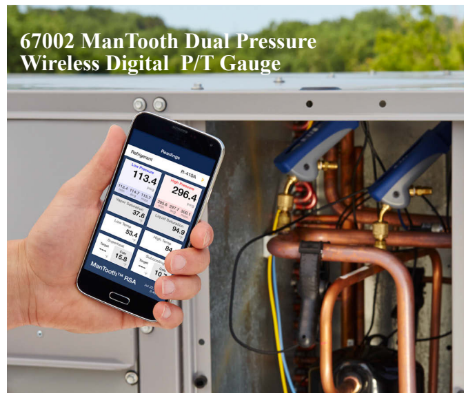
67002 ManTooth Dual Pressure Wireless Digital P/T Gauge