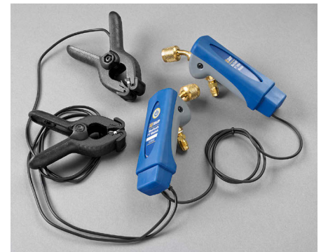
67002 - ManTooth Dual Pressure Wireless Digital P/T Gauge

For dual pressure readings, use two of the 67001 YELLOW JACKET ManTooth single pressure gauges or the YELLOW JACKET ManTooth Dual Pressure Unit (Part #67002) comes with a P/T module, tether unit and two temperature probe clamps. This unit also includes a convenient carrying case which can be purchased separately for the single pressure unit.