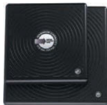
Model 68802 – 110 lbs. (50 kg) 9" x 9" (228 mm x 228 mm)