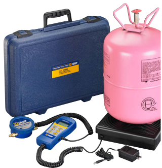
Model 68803 – 110 lbs. (50 kg) 9" x 9" (228 mm x 228 mm)

Added capabilities for automated, faster and more economical charging. Simply program the charging weight and the valve will close automatically when the charge is complete.