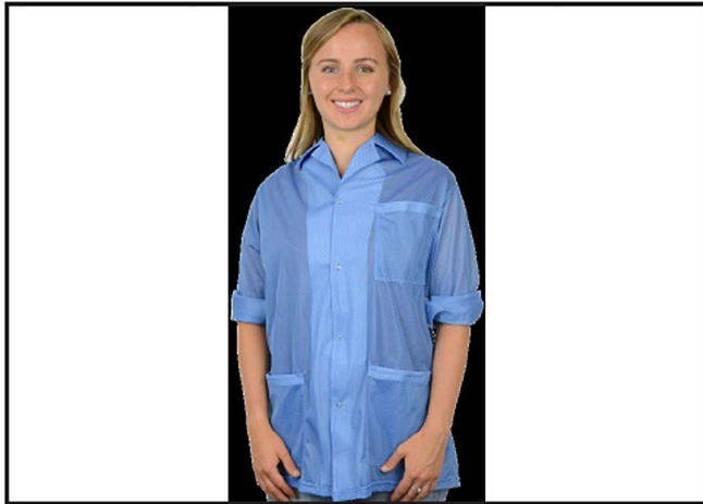
Figure 1. Desco Statshield® Smocks with Convertible Sleeves and Snaps Cuffs.