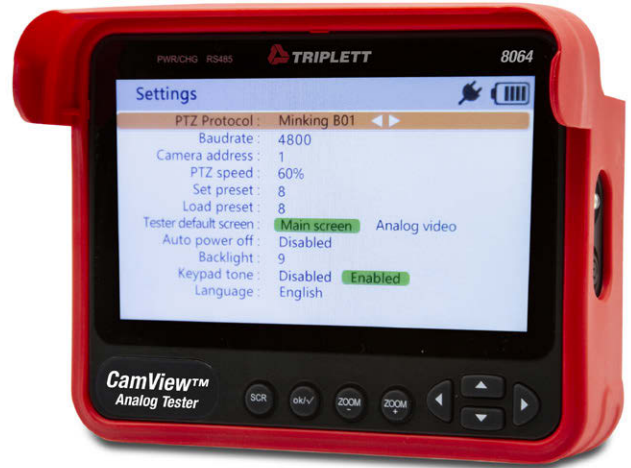
Compact and lightweight wrist strap design keeps your hands free